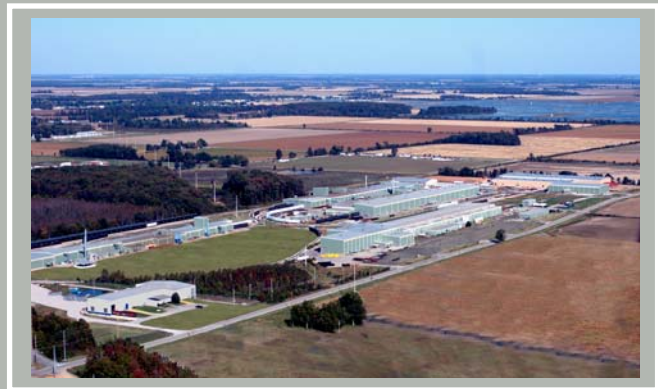
American Railcar Industries