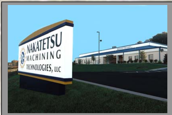
Nakatetsu Machining Technologies

We have the RESOURCES , we take the RESPONSIBILITY and deliver the RESULTS our clients expect for nearly 100 years!