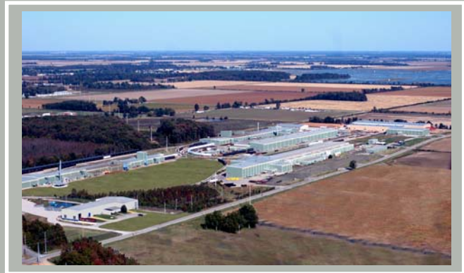
American Railcar Industries