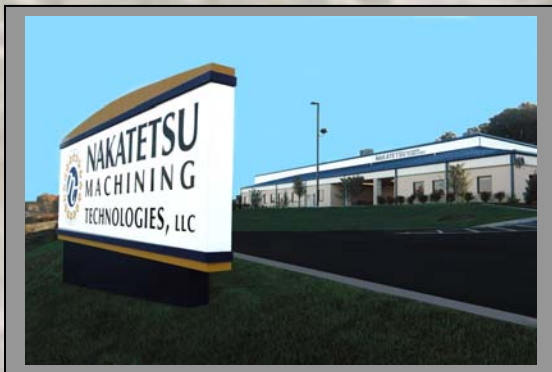
Nakatetsu Machining Technologies

We have the RESOURCES , we take the RESPONSIBILITY and deliver the RESULTS our clients expect for over 100 years!