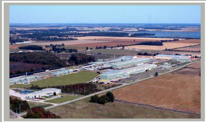
American Railcar Industries