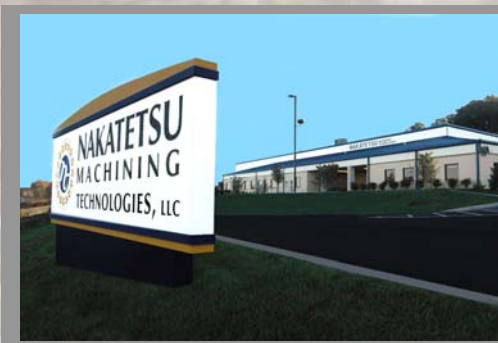
Nakatetsu Machining Technologies

We have the RESOURCES , we take the RESPONSIBILITY and deliver the RESULTS our clients expect for over 100 years!