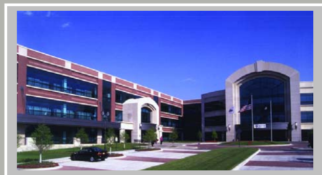
Papa John's USA